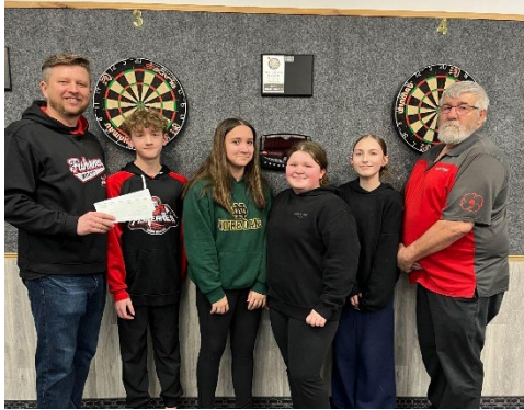
Picture of the presentation made to the Selkirk Legion Youth Darts league for funding to attend the National Championships in Quebec, April 13-18.

Darts are in on their final weeks, crib averaging 15 tables and poker is doing well. Keep up to date with upcoming events by checking the bulletin board.