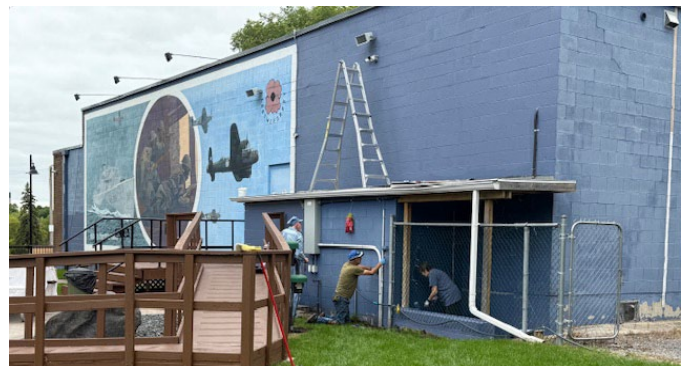
Michelangelo Crew hard at work!