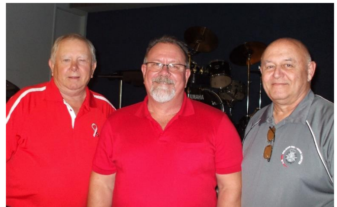
The Three Amigos

MEMBERS NOTE: Join us at our next General Meeting April 25, 7:30PM Share your ideas or voice your concerns