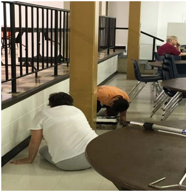
Or Monkey Business!