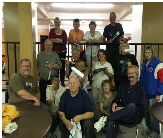
Paint Party Volunteers!