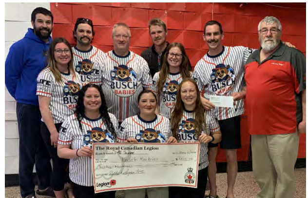
Donation presentation to Busch Babies Slo-pitch team